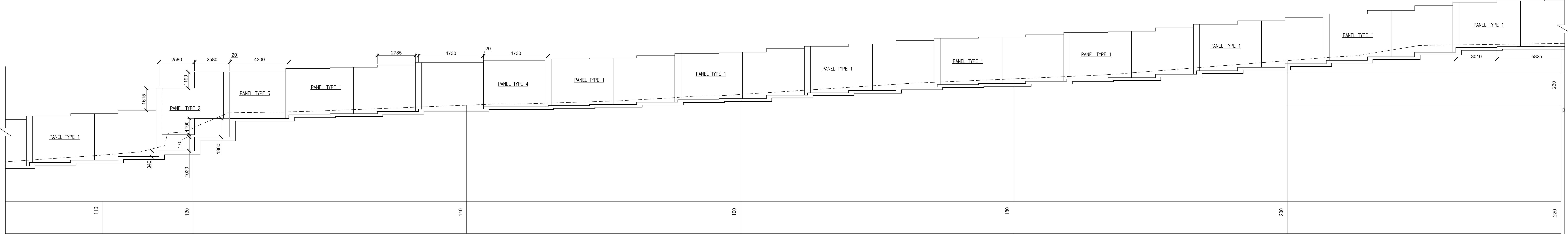
PROPOSED BOUNDARY WALL FROM 113.000 TO 220.000